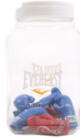
KEY CHAIN BUCKET CB01 WHITE