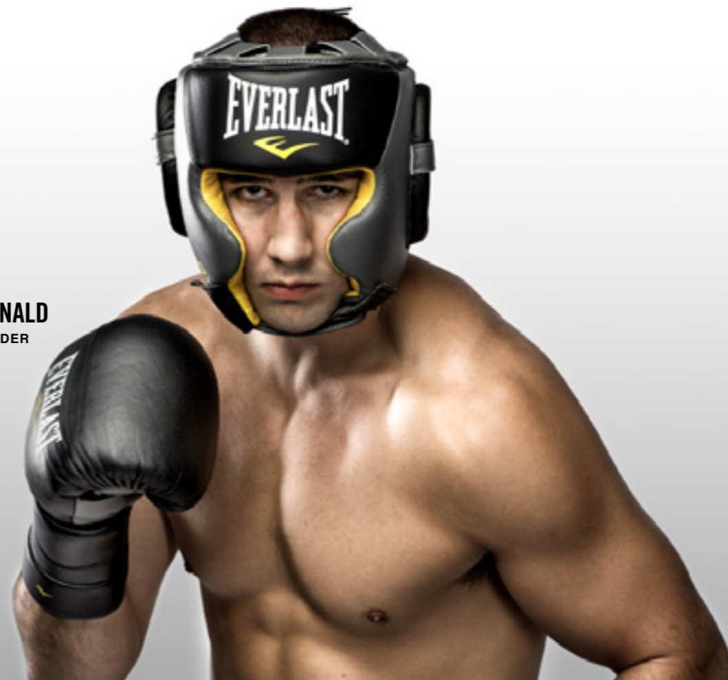
> RORY MACDONALD TOP MMA CONTENDER