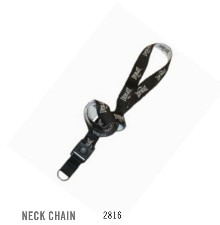
NECK CHAIN 2816 BLACK