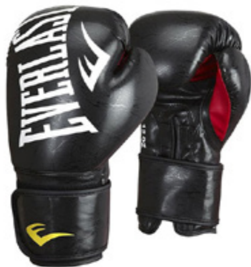
MARBLE GLOVE 7600