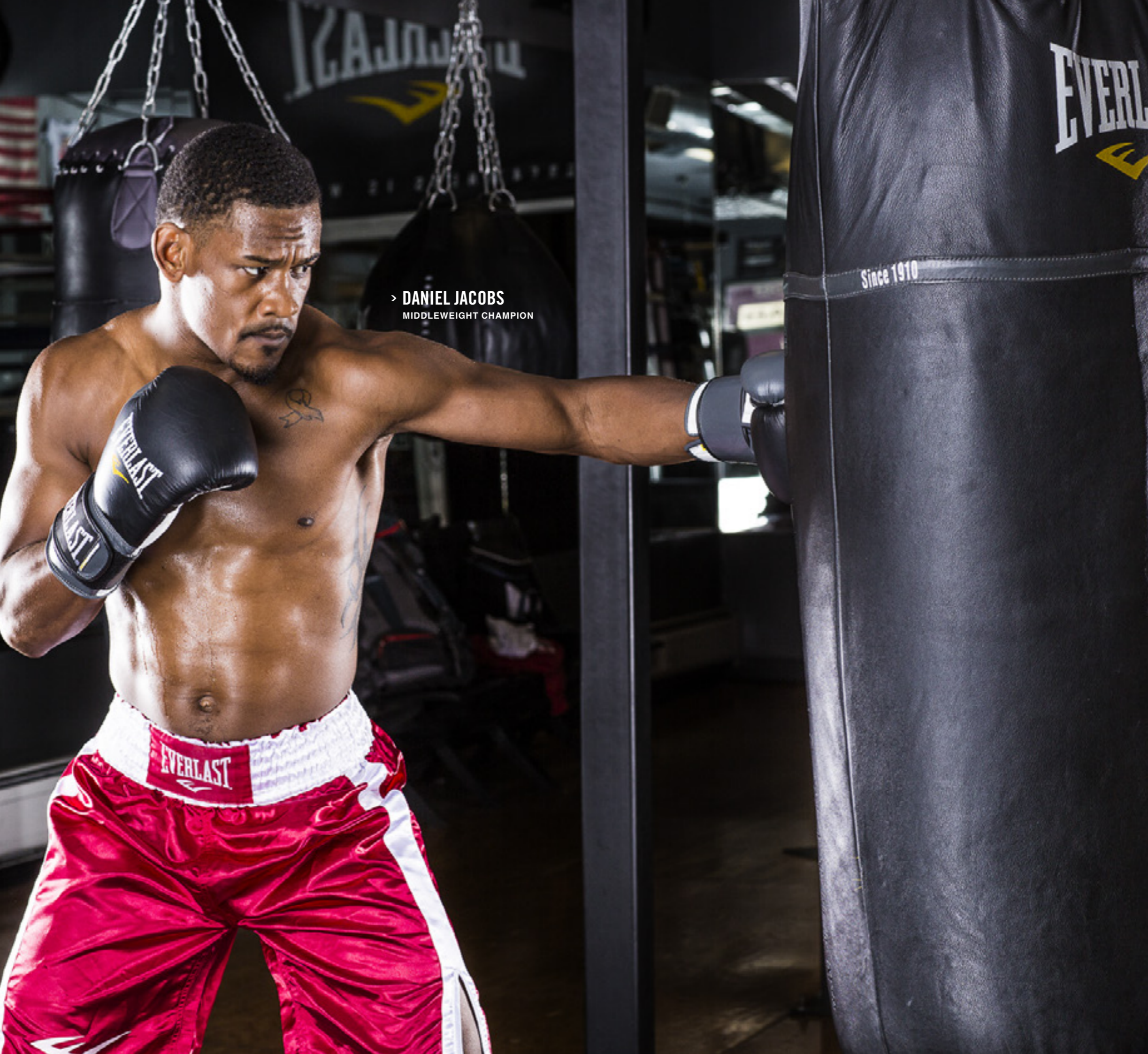
> DANIEL JACOBS MIDDLEWEIGHT CHAMPION