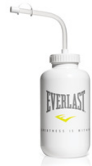
PRO STYLE WATER BOTTLE EVBTL001