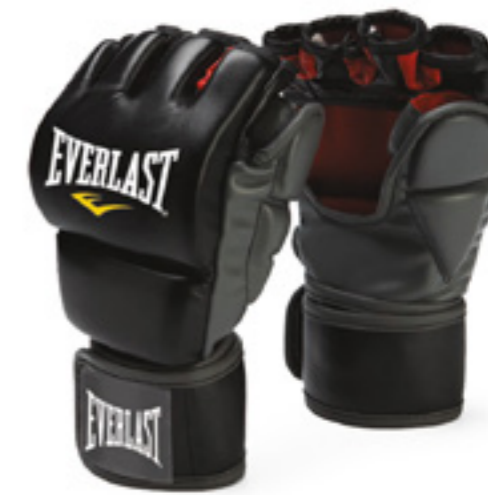
GRAPPLING TRAINING GLOVES 7772