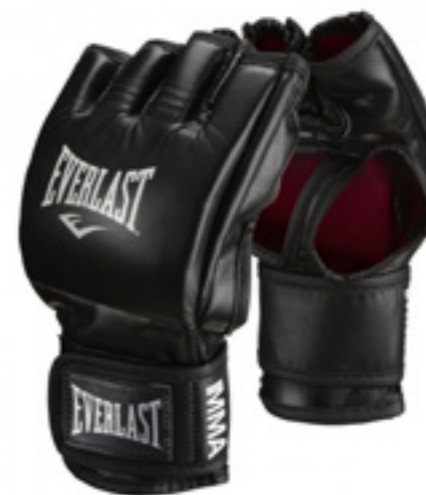
COMPETITION STYLE GRAPPLING GLOVES 7771