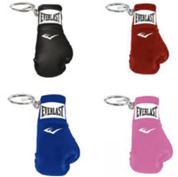
MINIATURE BOXING GLOVE KEY CHAIN 7000