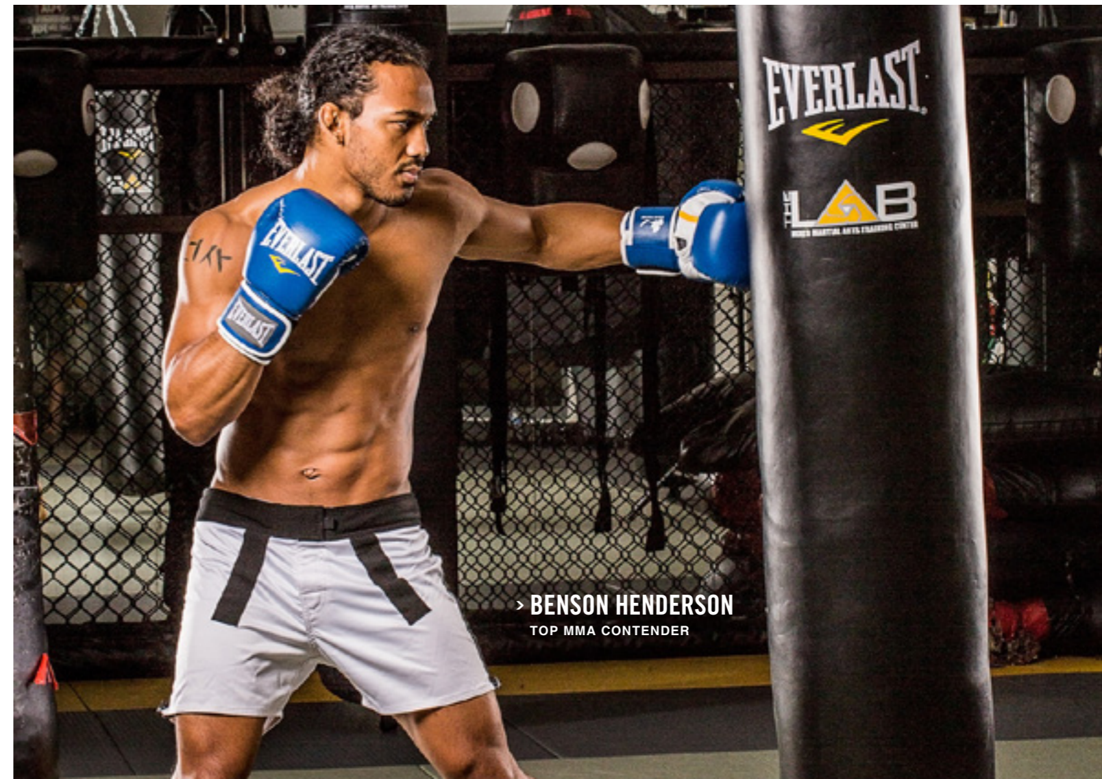
> BENSON HENDERSON TOP MMA CONTENDER