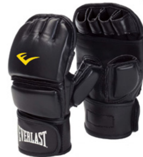
CLOSED THUMB GRAPPLING GLOVES 7562