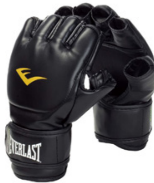
MMA GRAPPLING GLOVES 7560