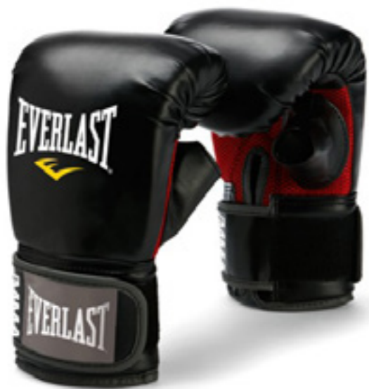
HEAVY BAG GLOVE 7502