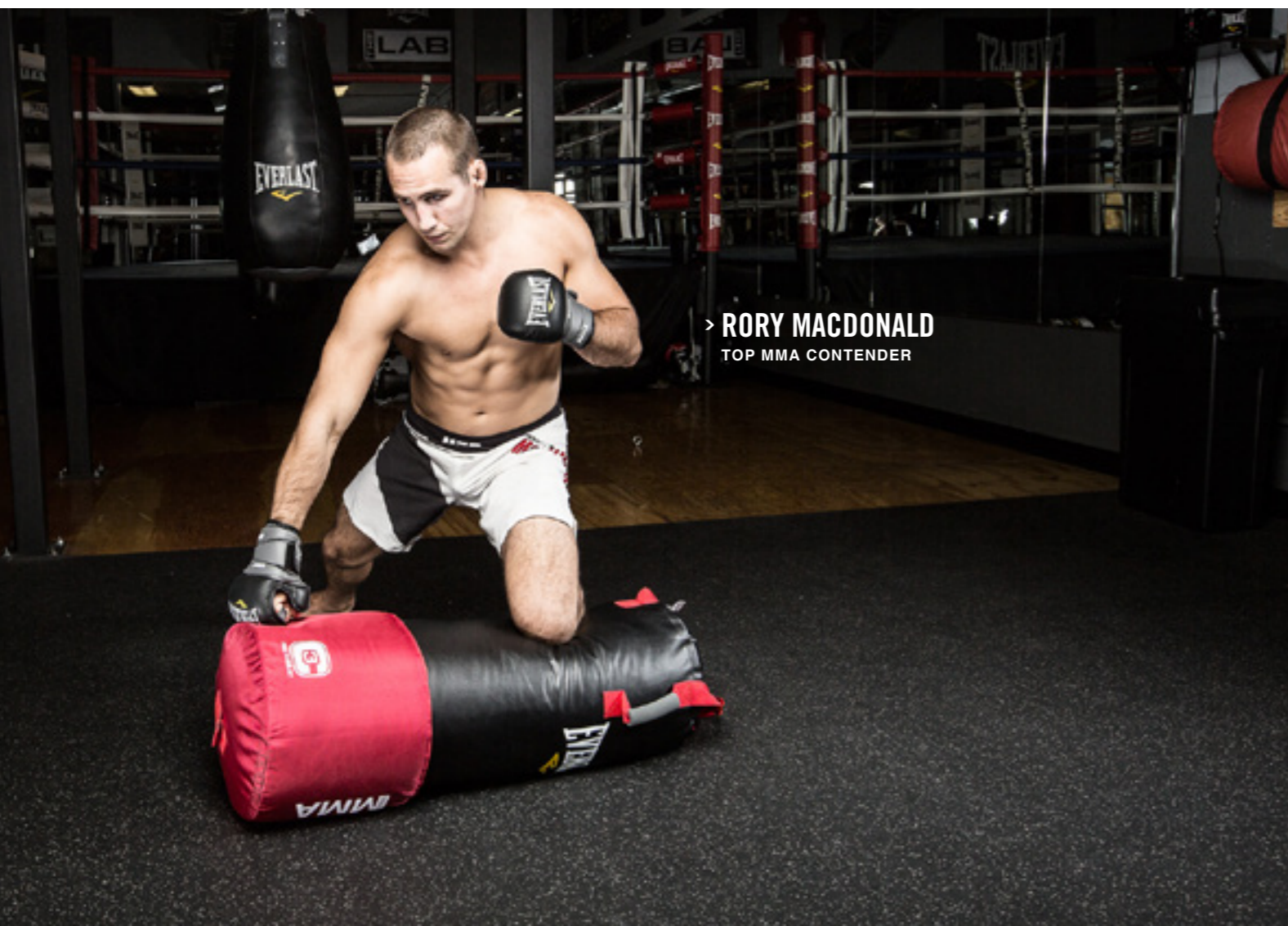
> RORY MACDONALD TOP MMA CONTENDER